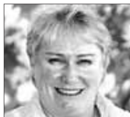
Olympian and breast cancer survivor Raelene Boyle

"I am urging the Federal Health Minister, Tony Abbott, to fast-track the assessment of this drug for the Pharmaceutical Benefits Scheme as a matter of urgency. It would be a tragedy if Australian women lost their lives unnecessarily because of bureaucratic delays."