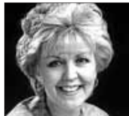
Showbusiness identity Patti Newton

"The evidence shows its usefulness in prolonging women's lives after diagnosis."