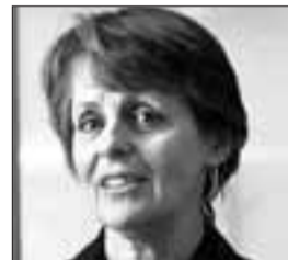
Democrats leader Senator Lyn Allison

"Women can't afford it. No woman should have to be worried about bills while fighting for their life."