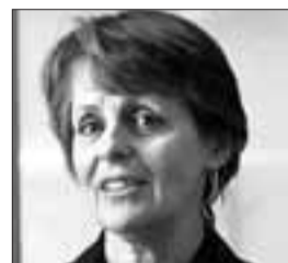
Democrats leader Senator Lyn Allison

"Women can't afford it. No woman should have to be worried about bills while fighting for their life."