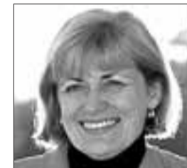
National Breast Cancer Foundation chair Ros Kelly AO

"It's important that all women have access to drugs that will help give them the best fighting chance, especially for young women who want to see their children grow up."