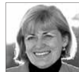
National Breast Cancer Foundation chair Ros Kelly AO

"It's important that all women have access to drugs that will help give them the best fighting chance, especially for young women who want to see their children grow up."