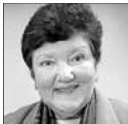
Former Victorian Premier Joan Kirner

"I strongly endorse the Cancer Council's call for the listing process to be fast-tracked."