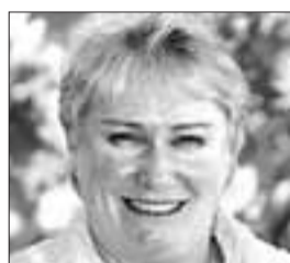
Olympian and breast cancer survivor Raelene Boyle

"I am urging the Federal Health Minister, Tony Abbott, to fast-track the assessment of this drug for the Pharmaceutical Benefits Scheme as a matter of urgency. It would be a tragedy if Australian women lost their lives unnecessarily because of bureaucratic delays."