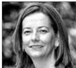
Federal Opposition health spokeswoman Julia Gillard

"It's a fantastic drug and every woman should have the opportunity to have it."