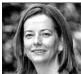
Federal Opposition health spokeswoman Julia Gillard

"It's a fantastic drug and every woman should have the opportunity to have it."